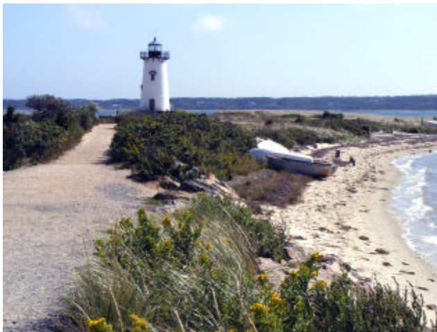
Martha's Vinyard off Cape Cod