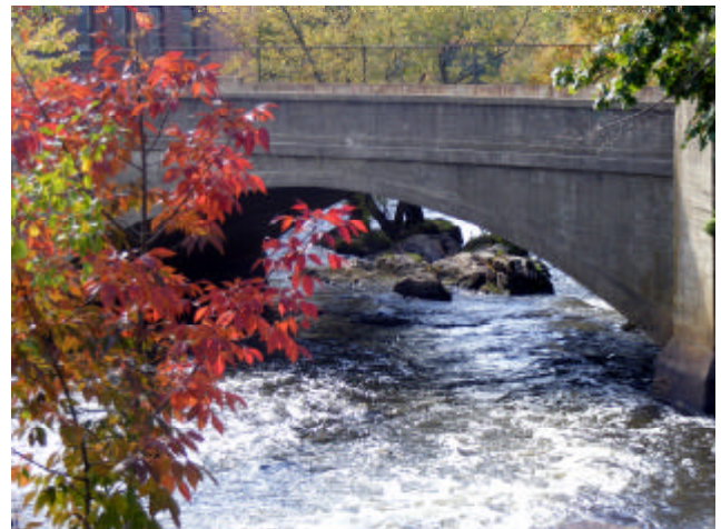
By the woolen mills in Lowell, Mass. They used the rivers for power.